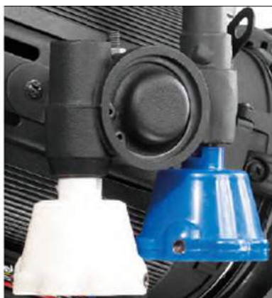
POLE OPERATED VERSION