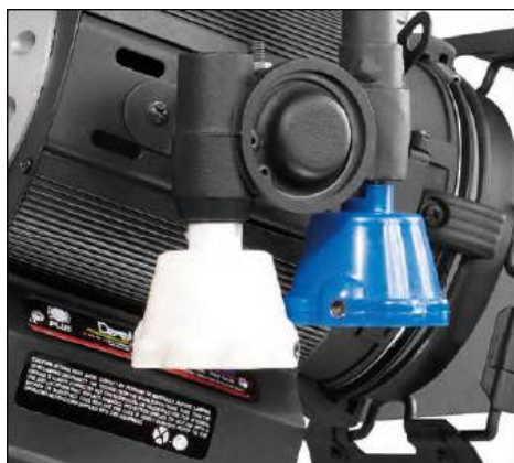
POLE OPERATED VERSION AVAILABLE