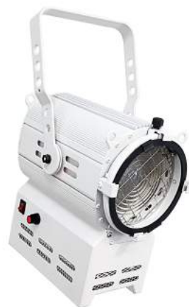
FRESNEL LED 90W - MODEL 53-19/A